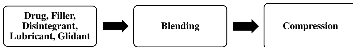
Figure 2: Flow sheet of the direct compression process.

of direct compression tableting. [4] The term direct compression is used to define the process by which tablets are compressed directly from powder blends of active ingredient and excipients, which flow uniformly in the dies & forms a film compact. [5]